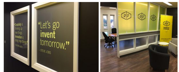
“DARE TO DO” is the motto of North Forge East and its new president